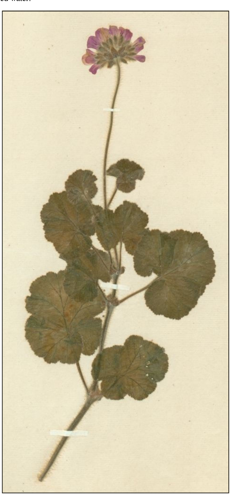
Fig. 5. Geranium sp. From the St. Aubyn herbarium.

The watermarks on the paper used by Sir John are varied. Several sheets of paper have been cut up so that the watermarks are not visible, other times the specimens block the view. Most of the seaweeds which have been collected by John MacCulloch have been mounted onto a separate piece of paper before they were given to Sir John. These specimens have been attached to the gatefold sheets with the original piece of Mac-Culloch's paper so the watermarks are not visible. However, on each of MacCulloch's sheets it is possible to see through the paper.