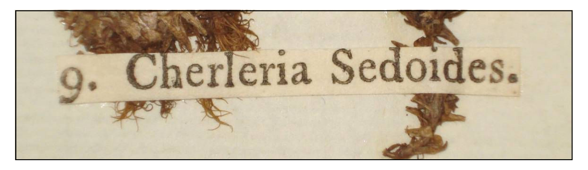
Fig. 6. Cherleria sedoides - one of the many printed straps used on the St. Aubyn herbaria (Copryrght, Plymouth City Museum and Art Gallery).

Visible on the reverse are some of MacCulloch's sketches which are fascinating. However, apart from these specimens, the watermarks can be clearly deciphered: