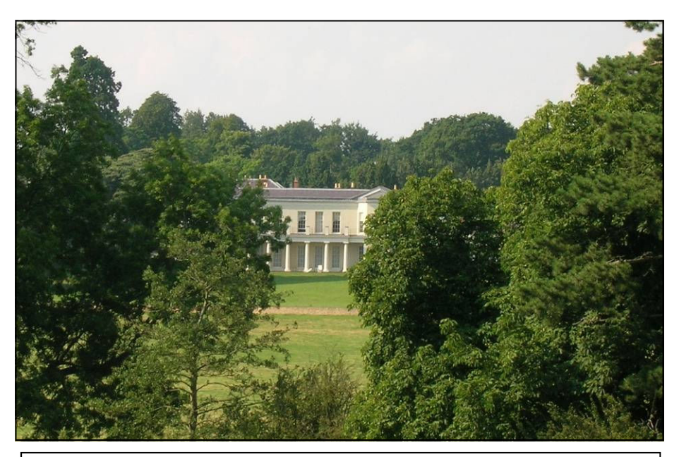
Fig. 8. Woolmers Polo Ground, Herefordshire; one of Sir John St. Aubyn's many houses.