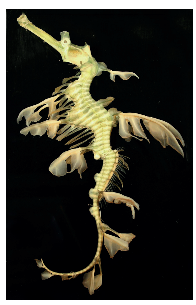
Figure 4. The leafy sea dragon Phycodurus eques (Günther, 1865) REDCZ-COLE3206.

it was when I set eyes on it for the very first time more than 40 or so years ago" (Cowper, 2007). (Figure 4).