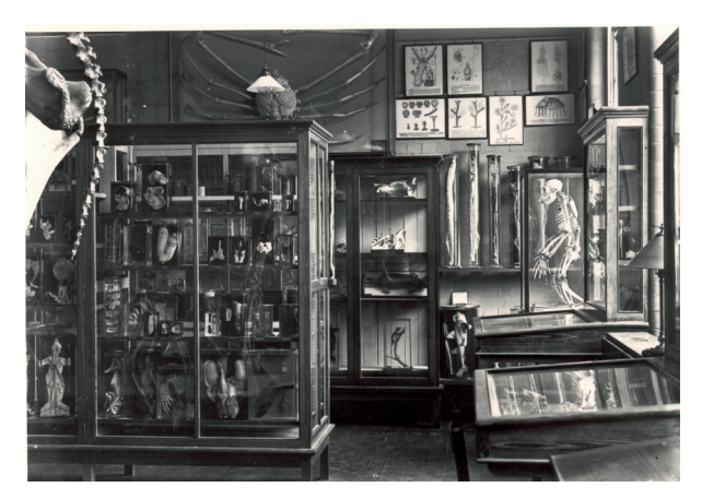
Figure 6. The Cole Museum at the London Road site.

The Museum was originally based on the London Road campus of the University (Figure 6). After Cole's retirement in 1939, space was an issue. After a delay due to the outbreak of World War II, a new zoology building was completed at the London Road site, with basements that could double as air-raid shelters. The aforementioned 1956 Nature article on Professor Cole and his Museum noted that the Museum was housed in an inadequate building, stating that "it is greatly to be hoped that on the new University site..." (the Whiteknights campus purchased in 1946) "...a worthy building will be planned", and also that the University would make sure that it maintained "what is a unique asset, not only for the University of Reading, but also for the entire country" (Anon., 1956).